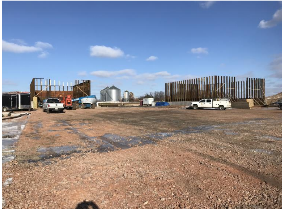
Sand and Salt Shed timbers onging