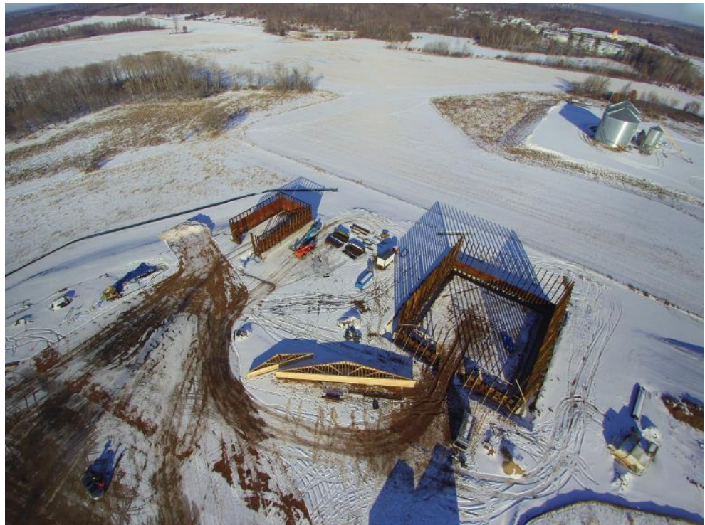
Aerial view of Sand and Salt Sheds