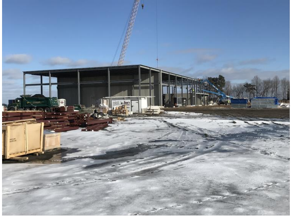
Steel erection at Unit B Repair Shop ongoing