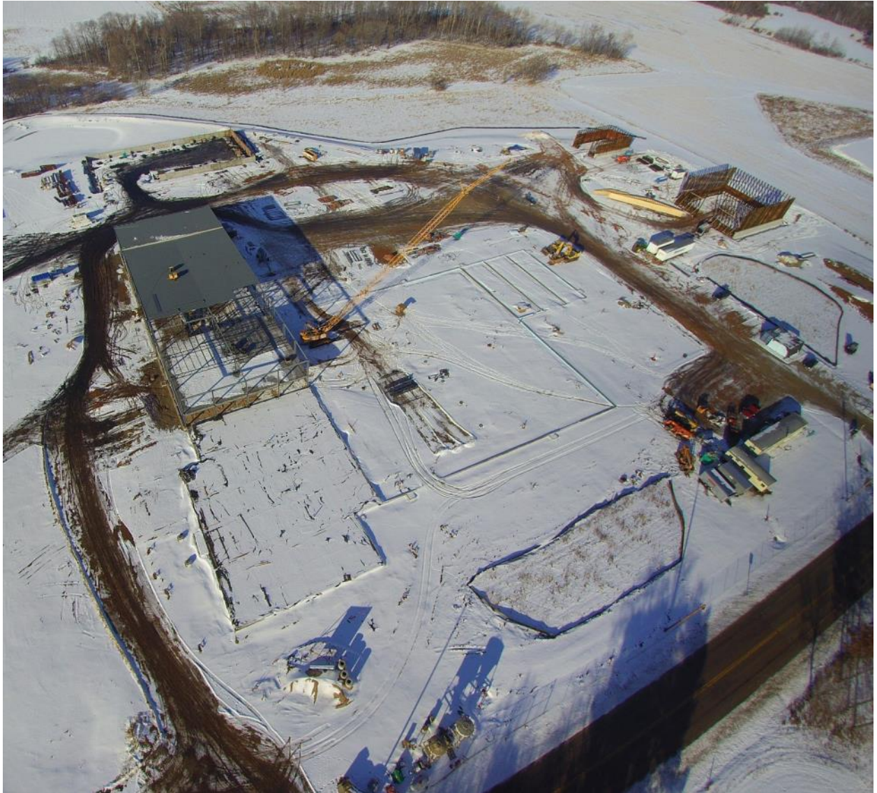
Aerial View from County A 1/5/2019