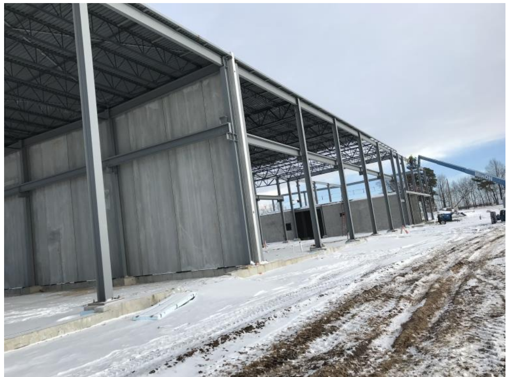
Interior precast concrete walls erected