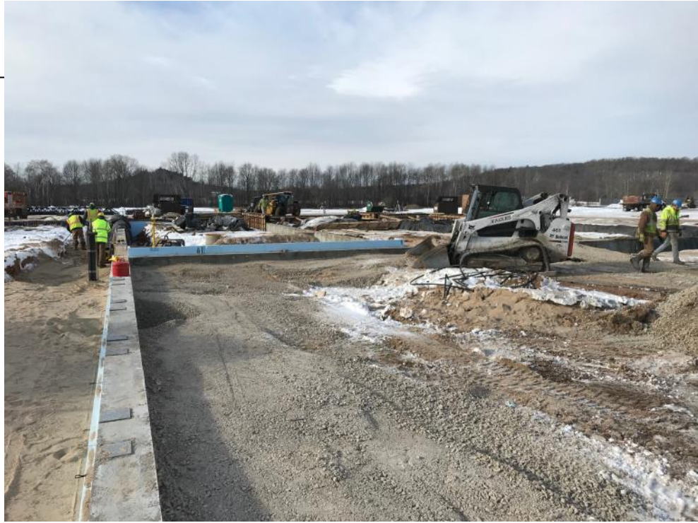
Last of Main Building foundations and backfill are complete