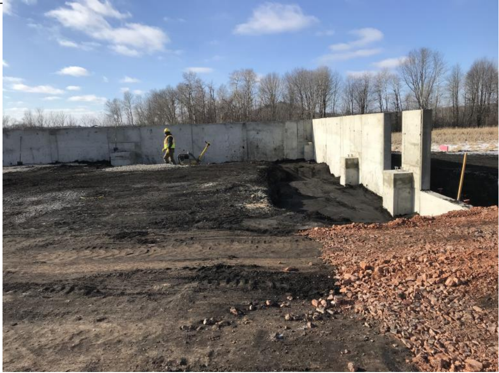
Unit E—Cold Storage foundations and backfill ongoing