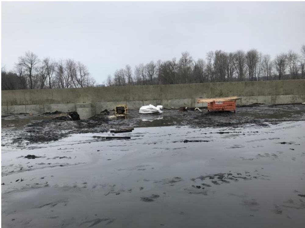
Cold Storage (Unit E) foundations