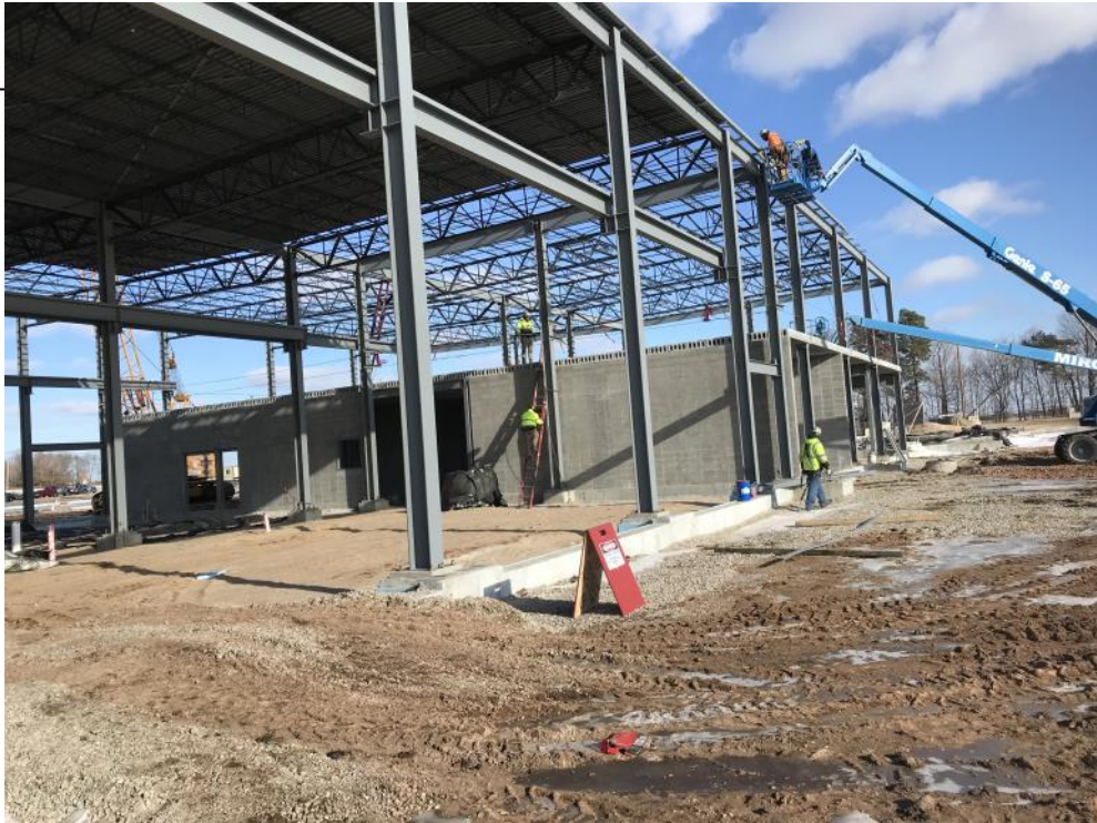
Precast concrete floor panels erected