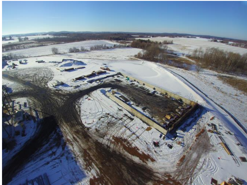
Cold Storage Foundations underway and Storm Pond behind.