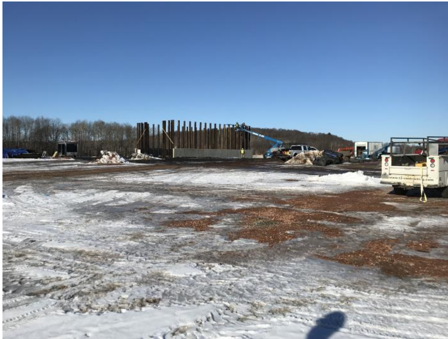
Sand Storage Shed timbers ongoing